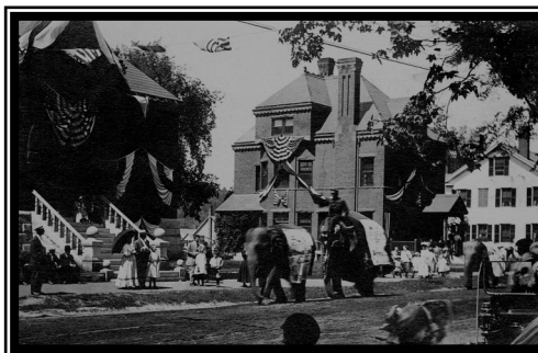
150th Celebration Parade in front of old Richards Free Library, with elephants.