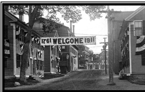
Depot Street decorated for the 150th Birthday celebration.

The Post Office special cancellation on Oct. 6, 12-5, will be a great opportunity to create your own collectibles. Send them to family or friends or to yourself!